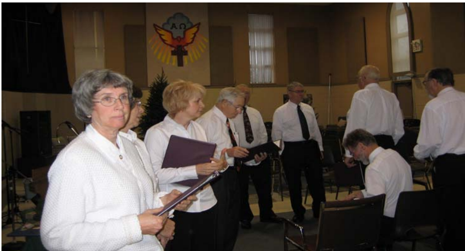
festival choir warm-up, December 23