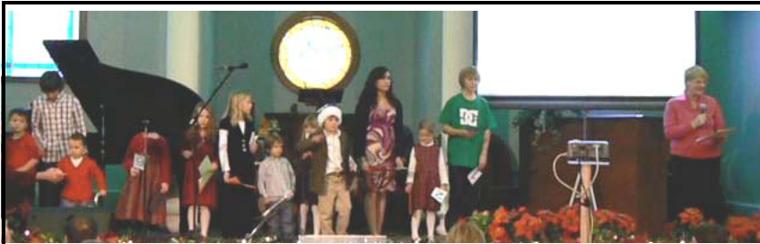
"The 12 Days of Christmas" presented by the children at the 4pm Family Service Christmas Eve.

10: 45 family service, nursery and Sunday school