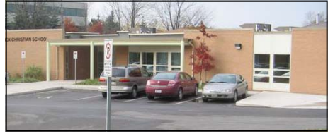
John Knox Christian School, 795 Highway 8, Stoney Creek (Fruitland)

Your brothers and sisters at St. Paul ABC