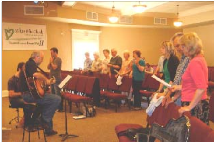
First Service, June 21