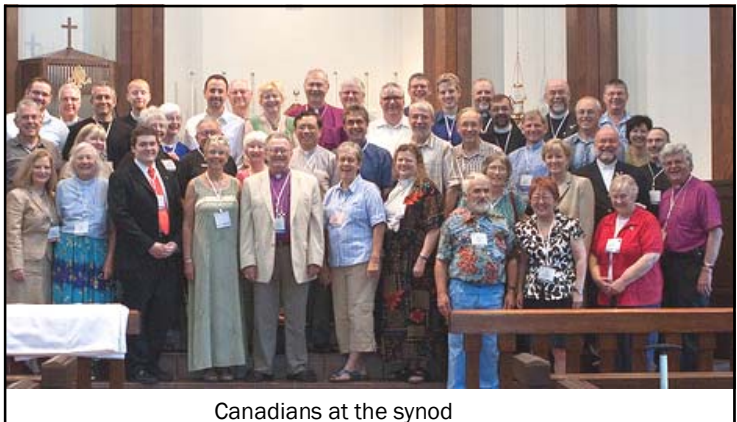
Canadians at the synod

Acknowledging the obvious fact that I am hardly objective, I have to say that I really believe the Common Cause Partnership, and now the new church, have afforded us Canadians an opportunity to participate and to contribute in ways which have gone far beyond our numbers relative to the total numbers of members of ACNA.