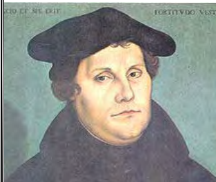
Martin Luther servant of God 1483-1546